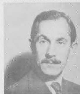
MR. MORDECAI REGINALD KIDRON Deputy Permanent Representative of Israel to the United Nations